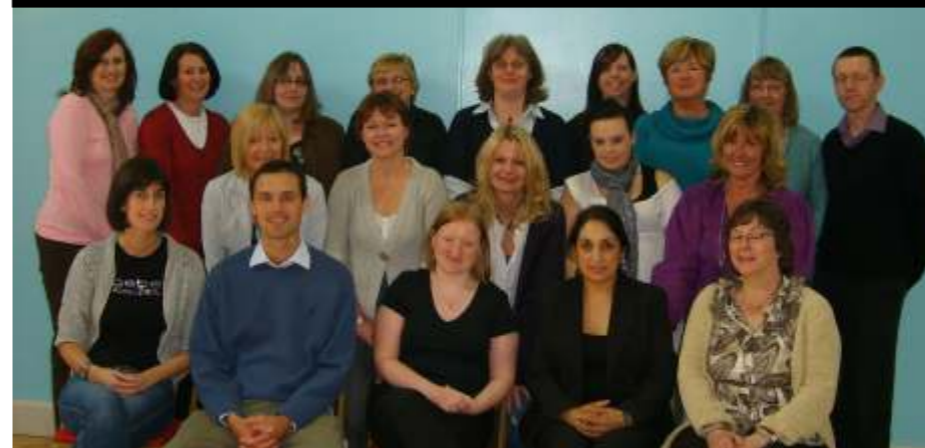
Nottingham City and Nottinghamshire County Early Years Professionals (EYPs) recently came together for a day of sharing and networking at Pleasley Landmark Centre, Mansfield.

We have 51 Early Years Professionals (EYPs) in Nottinghamshire from a variety of settings and roles. Recent consultation about the role of an EYP showed us what potential qualities an EYP should have. Feedback included being a good communicator; dedicated; being a creative thinker; reflective; having a consultative approach and having forward thinking vision. To ensure our EYPs have appropriate support and guidance we've developed a network where EYPs can meet, share ideas, and explore a range of topics.