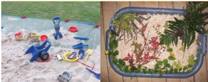
Some of the play day activities

Many thanks go to the Play Service team and also to the many partners who gave their time to support the days.