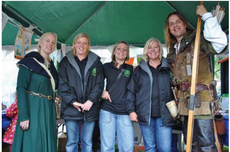
Some of the FIS team meeting Robin Hood and Maid Marion

Thank you to all those who helped plan and carry out the activities.