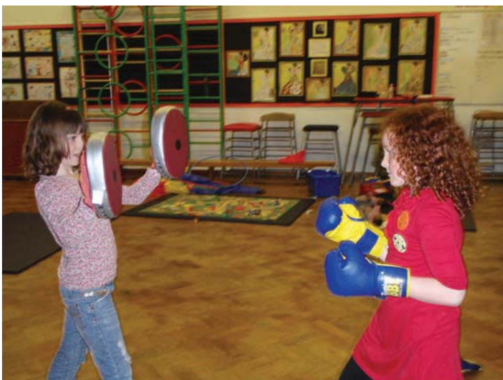
Activities at the Play to Care Scheme

Sessions were well attended and subject to demand will be opening during the Christmas holidays.